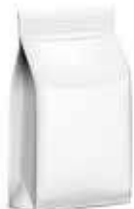
Flat Bottom Bags