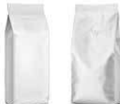
Side Gusset Bags