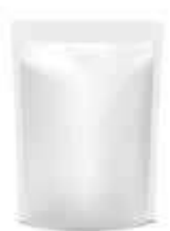
Stand Up Pouches