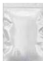
Three Side Seal